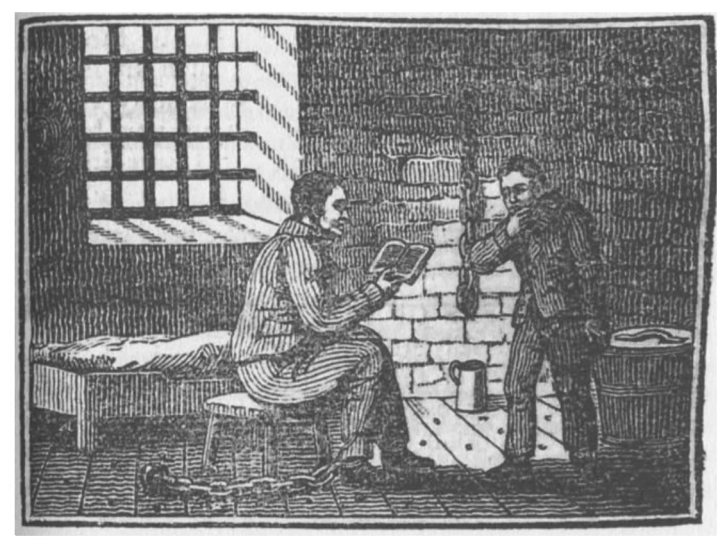
The Prisoner's Companion (New York: American Tract Society, 1827)