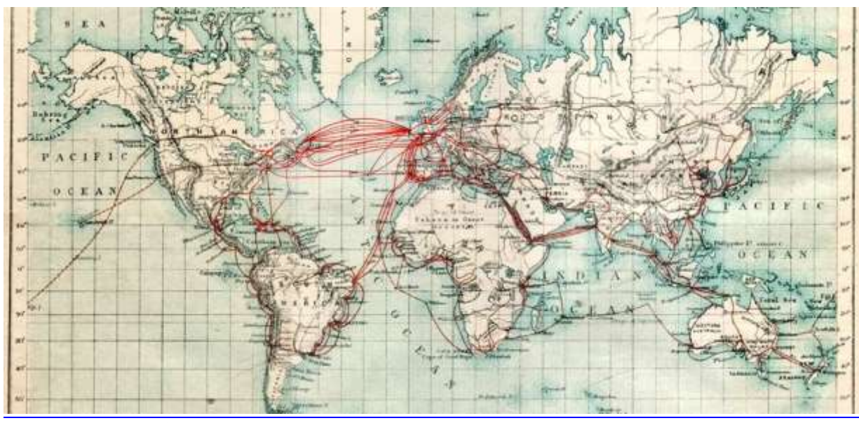
A.B.C. Telegraphic Code, 5<sup>th</sup> Edition, via Atlantic-cable

In the 19<sup>th</sup> century, 'American' literature had yet to be fully launched as a national cultural tradition, separate from England; early textbooks treated British and American works as part of the same continuum; the reception of American works in England, and vice-versa, were also complicated by weak copyright laws and flagrant infringements on existing copyright—or outright theft.